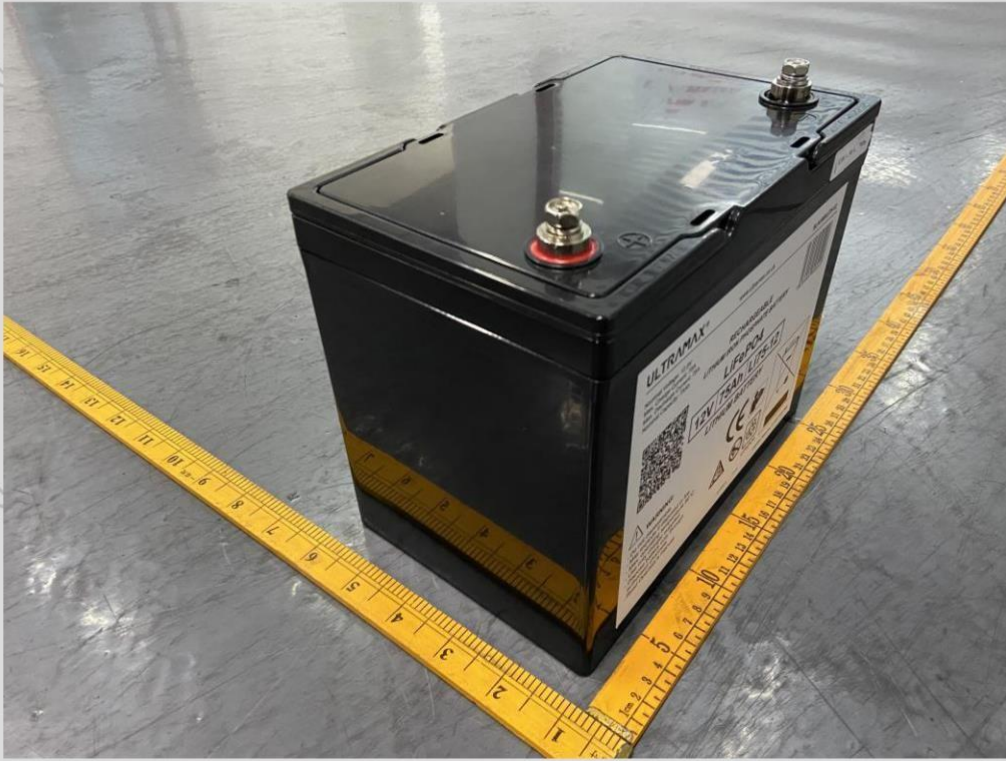
Figure 1 Overall view I of battery