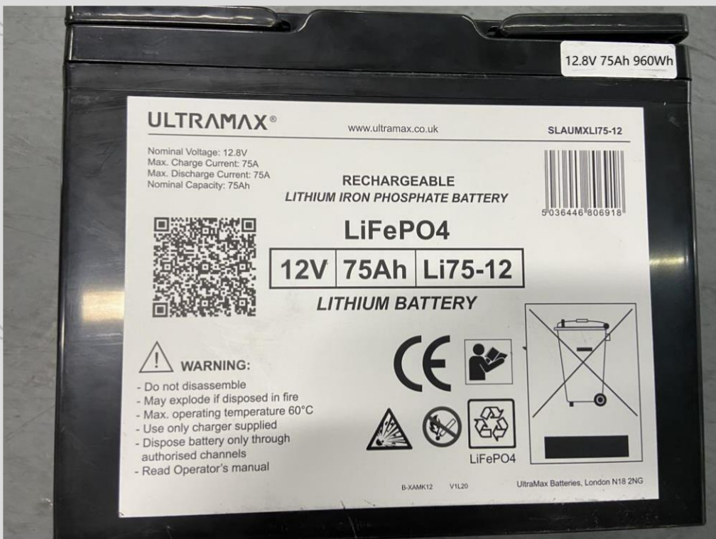
Figure 4 Battery Label