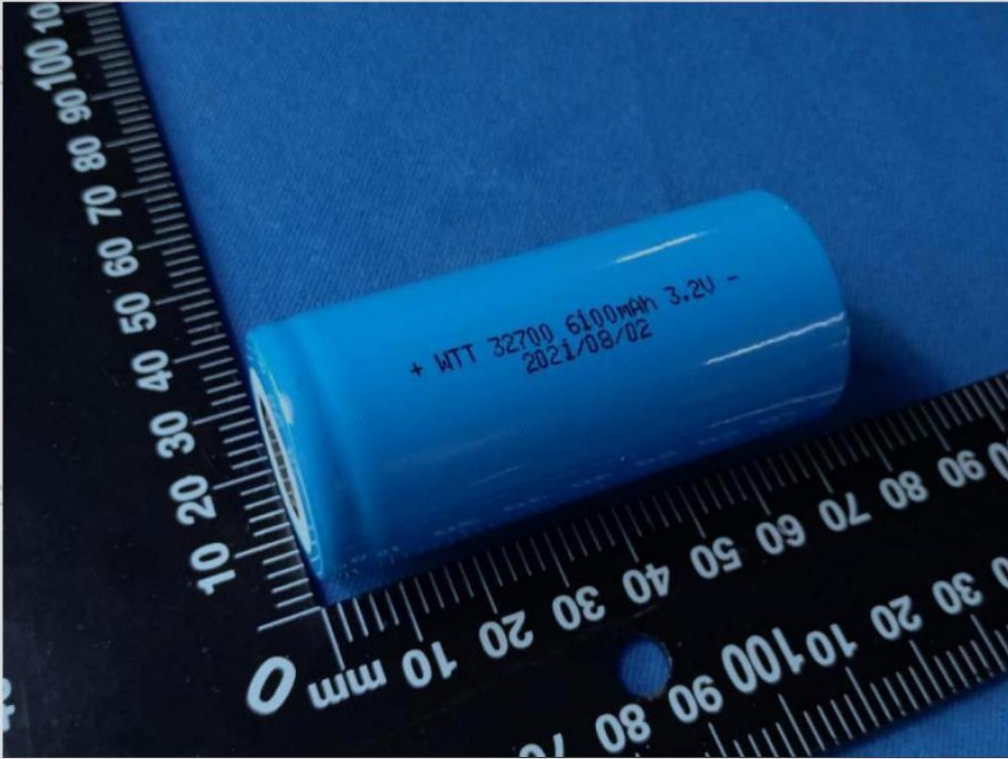
Figure 3 Overall view of cell