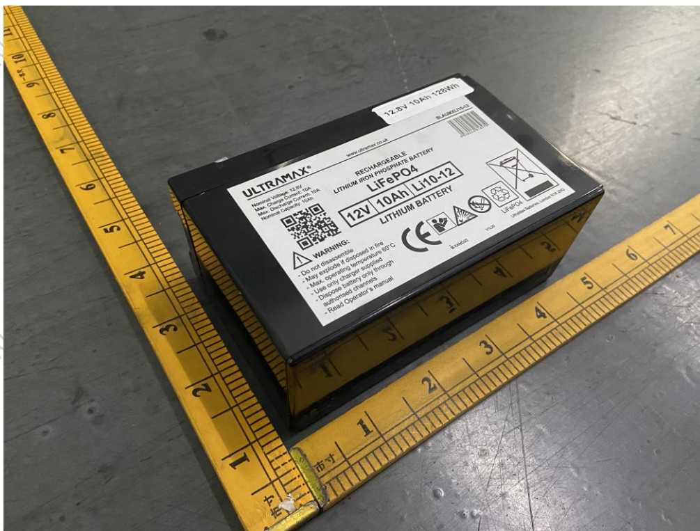
Figure 1 Overall view I of battery