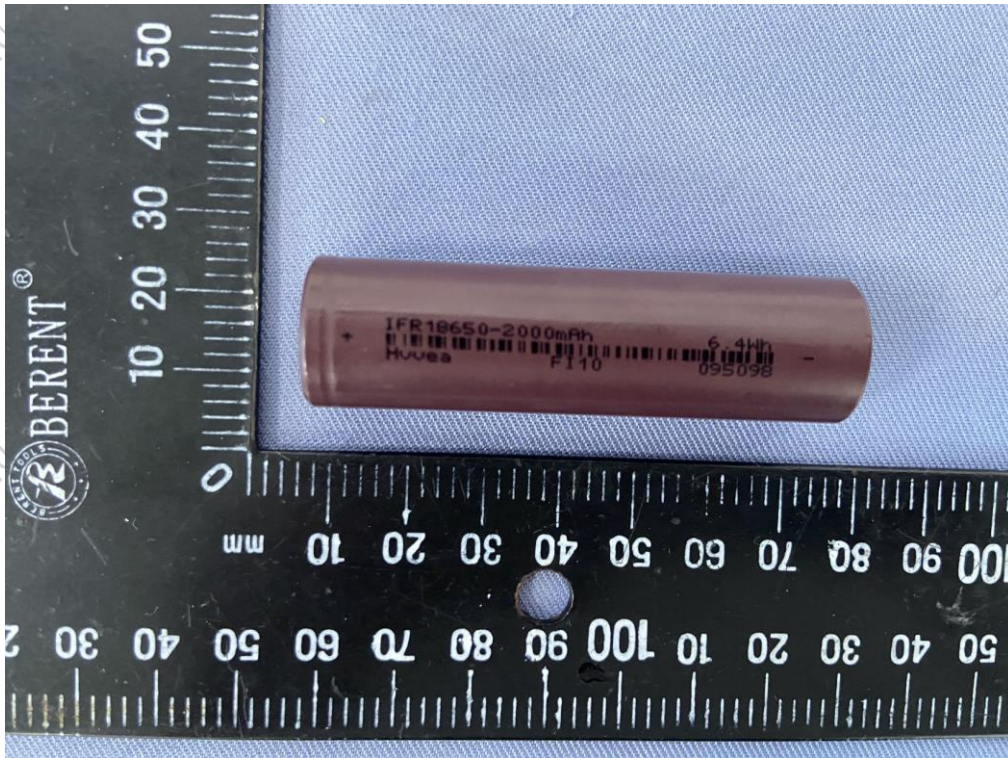
Figure 3 Overall view of cell