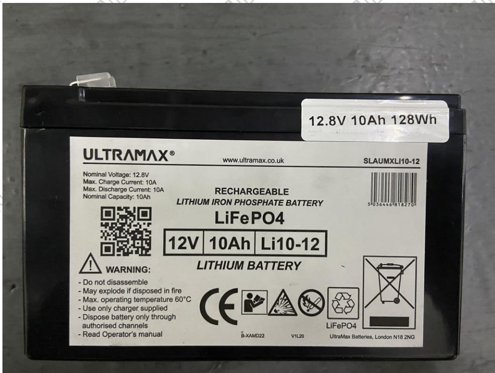
Figure 4 Battery Label